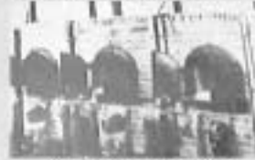
Gas Ovens at Auschwitz

Auschwitz and Birkenau together had the ability to kill 2,000 people at a time with the gas chambers alone. Another 5,000 people were burned alive in a 24 hour period when all the ovens were in use.