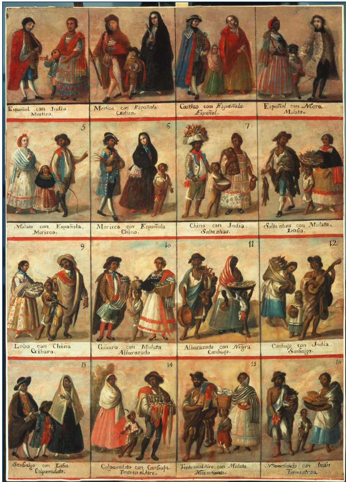
Figure 9. Unknown artist (Mexican); Human Races (Las Castas) (Mexican); oil on canvas; 18 th century; H: 40 7/8 in. (104 cm.), W: 58 1/4 in. (148 cm.); Museo Nacional del Virreinato, Tepotzotlan, Mexico.