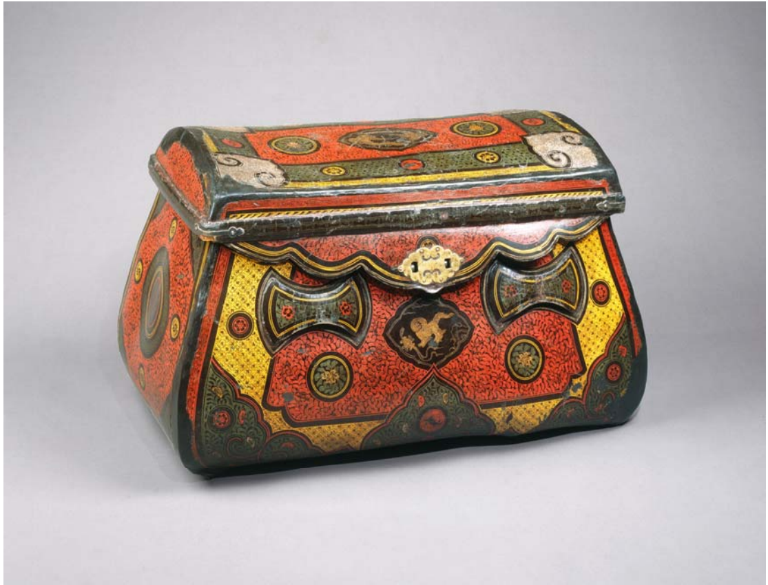
Figure 1. Traveling Coffer ; lacquer over leather, bamboo, wood, metal mounts; Chinese; Southern Song or Yuan Dynasty, ca.1250; H: 17 ¼ in. (43.8 cm.), W: 28 ¾ in. (72.1 cm.), D: 15 in. (38.1 cm.); Brooklyn Museum of Art, Brooklyn, New York.

In addition to the exchange of merchandise, traders came in contact with diverse cultures, lifestyles, and religions, and were exposed to the various social structures and political relationships between countries. Buddhism, for example, spread from India to China because of trade along the Silk Route, similar to the way Islam spread along trans-Saharan routes in medieval West Africa. 2