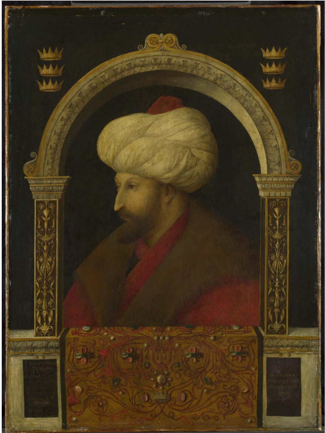
Figure 5. Attributed to Gentile Bellini (Italian, 1429-1507); The Sultan Mehmet II ; oil (19 th century repaint) on canvas; 1480; H: 27 ½ in. (69.9 cm.), W: 20 ½ in. (52.1 cm); The National Gallery, London, UK.