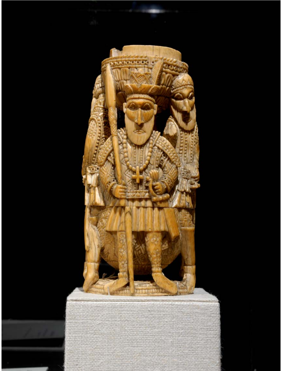
Figure 6. Edo artist, Court of Benin (Nigerian); Saltcellar with Portuguese Figures ; ivory; 15 th -16 th century; H: 7½ in. (19.1 cm); the Metropolitan Museum of Art, New York.