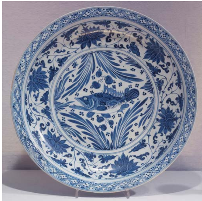
Figure 3. Porcelain Plate ; porcelain with underglaze blue decoration under colorless glaze; Jingdezhen, Jiangxi Province, China; Yuan Dynasty, mid-14 th century; Diam: 18 in. (45.7 cm); the Metropolitan Museum of Art, New York.