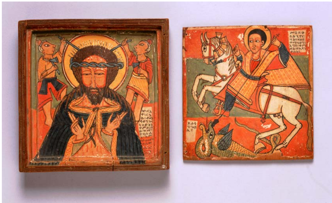
Figure 11. Gondar Workshops (Ethiopian); Double-sided diptych ; tempera on wood; 17 th -18 th century; 6 ½ in. (16.5 cm.), W: 6 5/8 in. (16.9 cm.), D: 1 3/8 in. (3.5 cm.); Newark Museum, New Jersey.

The production of religious art begun during Ezana's reign continued for centuries, although much of it was destroyed during Islamic incursions in the sixteenth century. Surviving examples were produced during the seventeenth and eighteenth centuries in the capital and trading center Gondar, where art workshops were established. The artists created manuscripts and icons that depicted Christian imagery with a distinctly Ethiopian aesthetic—simple forms, vibrant colors, and bold outlines. The icon below (Figure 11) is a diptych depicting Mary and the Christ child on the left side, and the Covenant of Mercy—in which Mary intercedes on behalf of the pious—on the right. Some diptychs like this were small enough to be worn as pendants by the nobility. 46