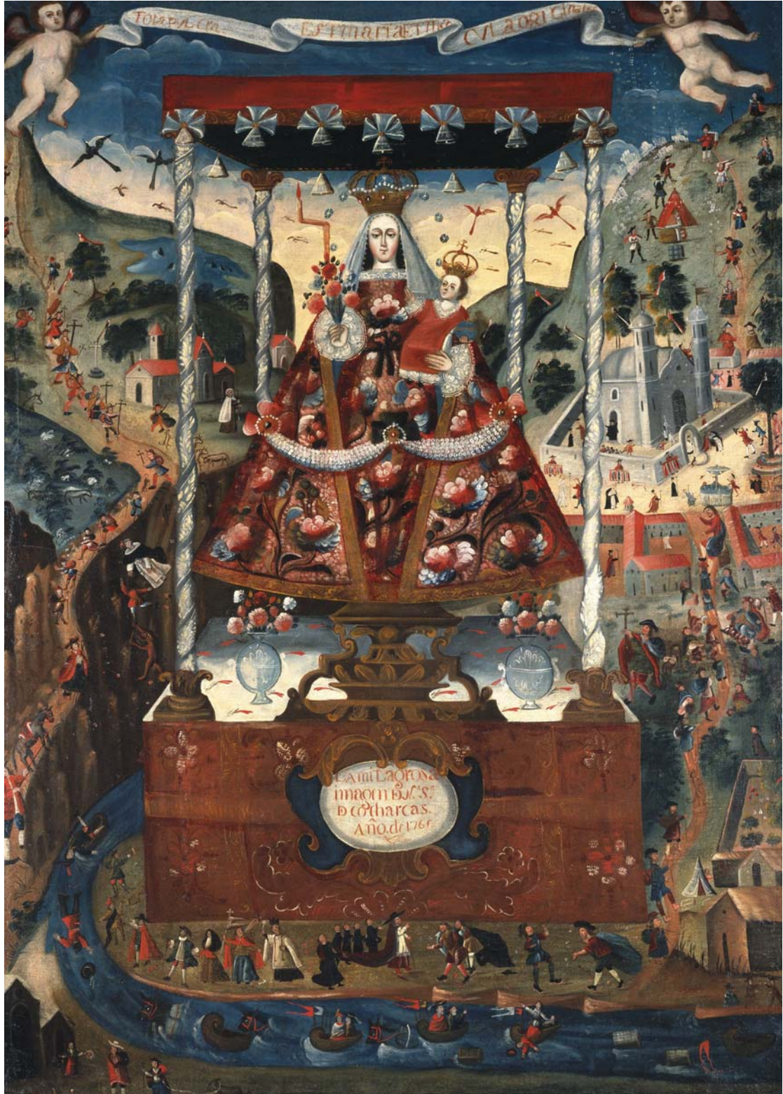
Figure 10. Unknown artist (Peruvian); Our Lady of Cocharcas Under the Baldachin ; oil on canvas; 1765; H:78 ¼ in. (198.8 cm), W:56 ½ in. (143.5 cm); Brooklyn Museum, Brooklyn, New York.