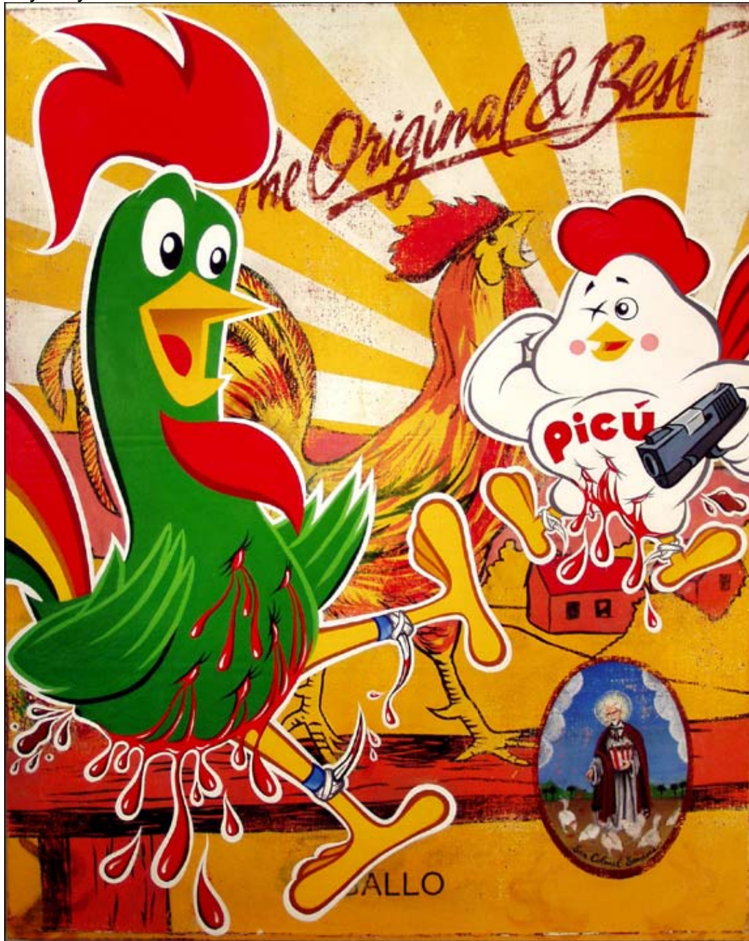
Figure 15. Miguel Luciano (Puerto Rican, b.1972); Pelea de Gallos ( Fight of the Roosters ); acrylic on canvas; 2002; H: 60 in. (152.4 cm.), W: 48 in. (121.9 cm.)

sovereignty. Although Puerto Ricans may enlist in the United States military, they may not vote in U.S. elections or host embassies.