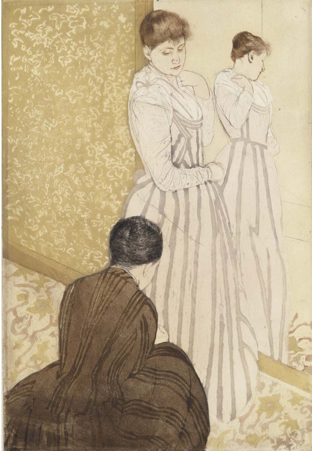
Figure 13. Mary Cassatt (American, 1844-1926); The Fitting ; drypoint and aquatint etching on off-white, moderately thick, moderately textured laid paper; 1890-1891; (Image) H: 14 13 / 16 in. (37.6 cm.), W: 10 1 / 8 in. (25.7 cm.); (Sheet) H: 17 1 / 4 in. (43.8 cm.), W: 12 in. (30.5 cm.); Brooklyn Museum, Brooklyn, New York.