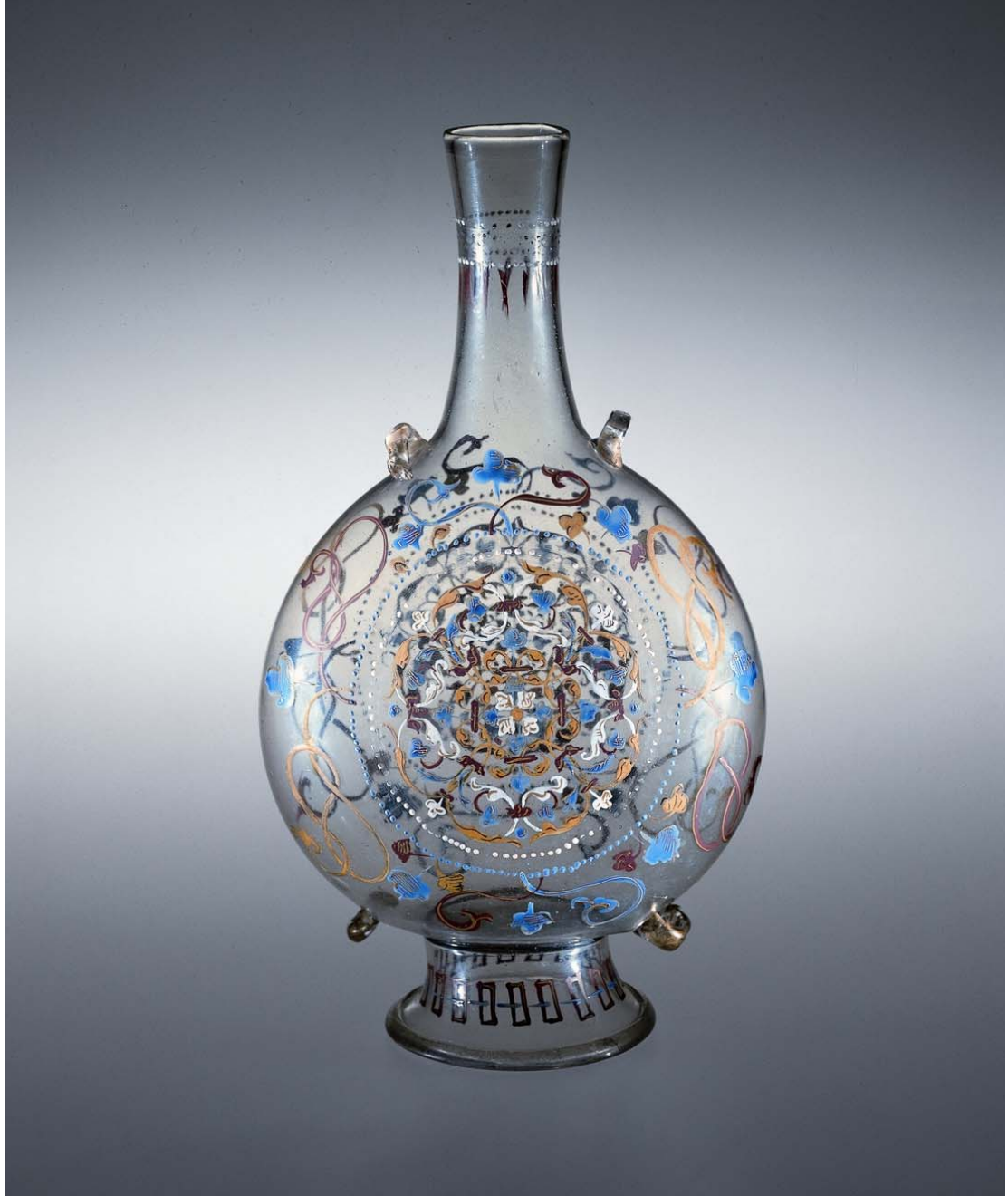
Figure 4. Pilgrim Flask ; free-blown glass, enameled and gilded; Venice, Italy; ca. 1500-1525; H: 12 3/8 in. (31.4 cm); Robert Lehman Collection, the Metropolitan Museum of Art, New York.