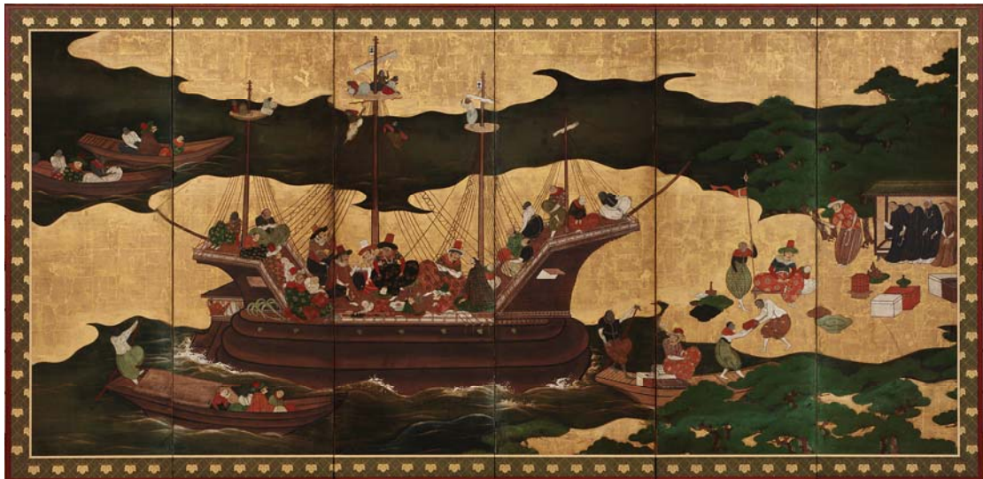
Figure 7. Kano School (Japanese); Namban ("Southern Barbarians" in Japan); ink, color, and gold on paper; Edo period, 17 th century; H: 60 ¼ in. (153 cm.), 130 ½ in. (331 cm.); The Freer Gallery of Art, Smithsonian Institution, Washington, DC.