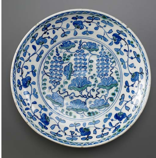
Figure 2. Dish with Grape Design ; stone-paste painted under colorless glaze; Iznik, Turkey; Ottoman period, late 16 th century; H: 2 5/8 in. (5.9 cm.), W: 12 3/4 in. (32.5 cm); Freer Gallery of Art, Smithsonian Institution, Washington, DC.