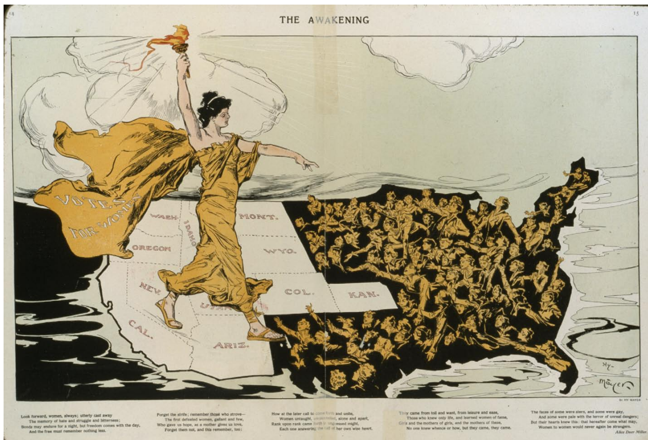
Item 6206 Henry Mayer, THE AWAKENING (Feb. 1915).