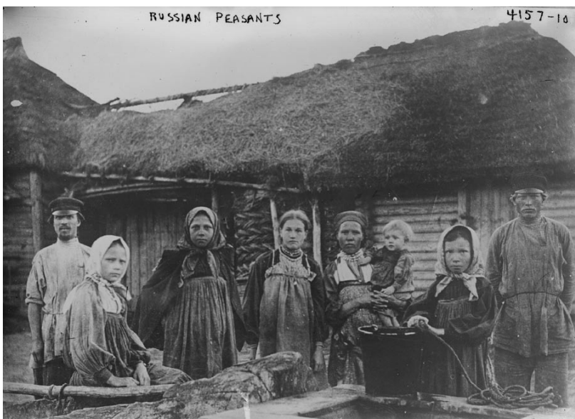
Item 4463 Unknown, RUSSIAN PEASANTS (n.d.).