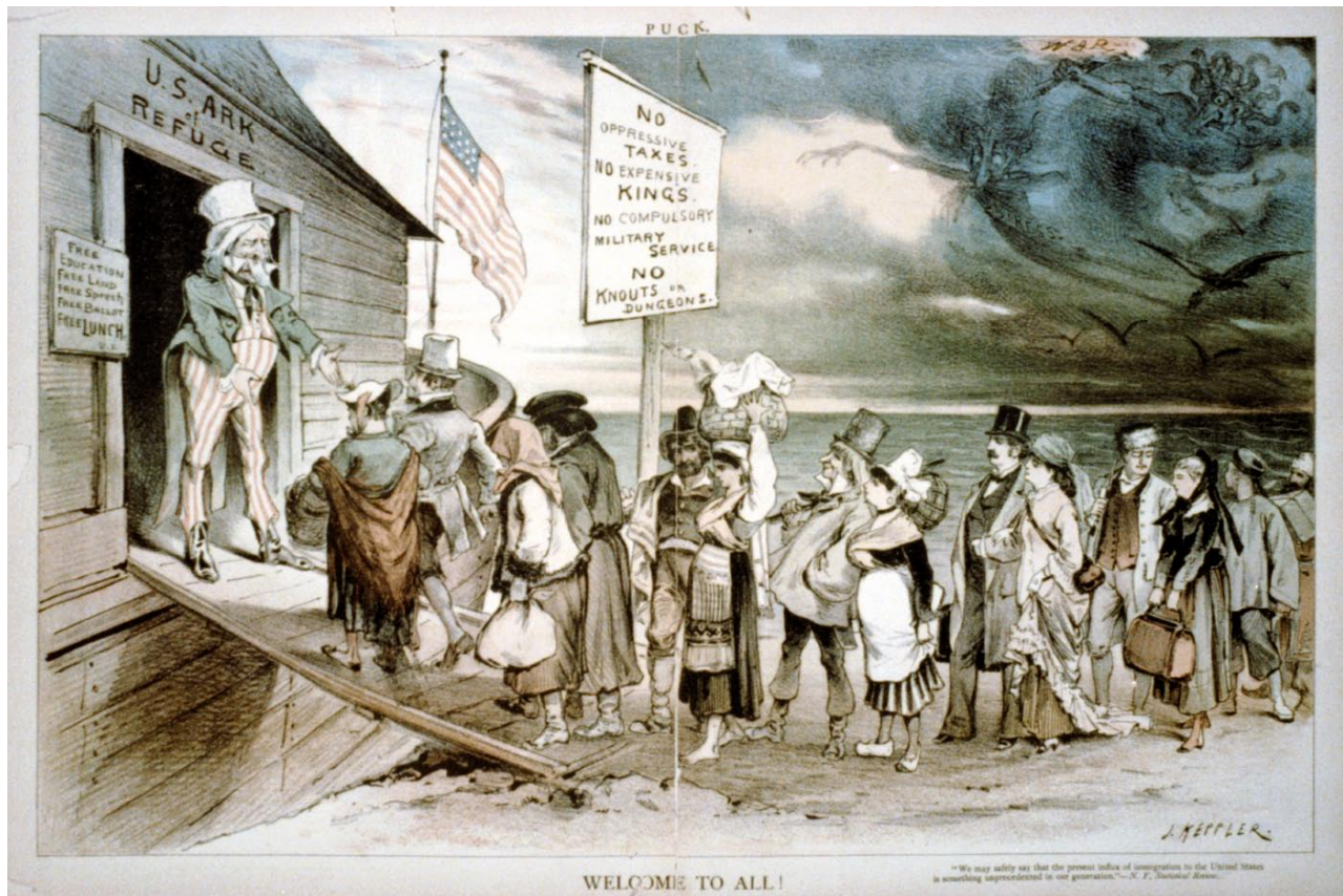
Item 6823 J. Keppler, WELCOME TO ALL! (1880).