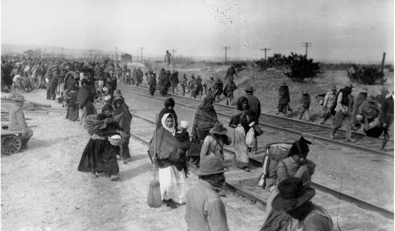
Item 5634 Unknown, MEXICAN IMMIGRANTS ARRIVING (1899).