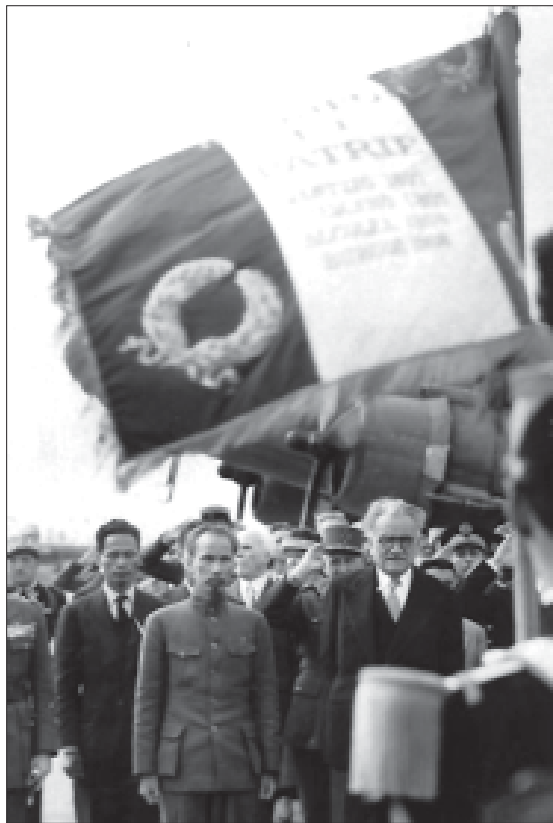
Ho Chi Minh, accompanied by Pham Van Dong, arriving in Paris, 1946