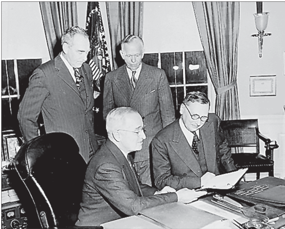
President Truman in the Oval Office with the Prime Minister of France, René Pleven, as Secretary of State Dean Acheson and Secretary of Defense George C. Marshall look on. (01/29/1951)