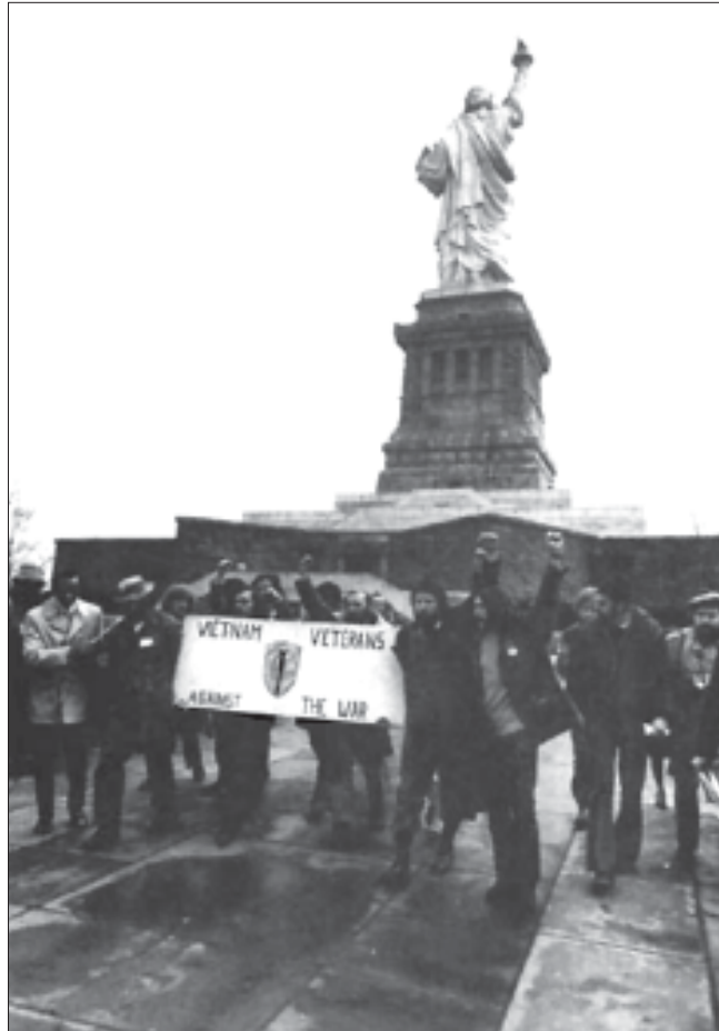
Members of the Vietnam Veterans Against the War leaving the Statue of Liberty, which they had occupied for two days.

Source: John Kerry, “Testimony before the Senate Foreign Relations Committee,” April 22, 1971, Congressional Record , Vol. 117:57.