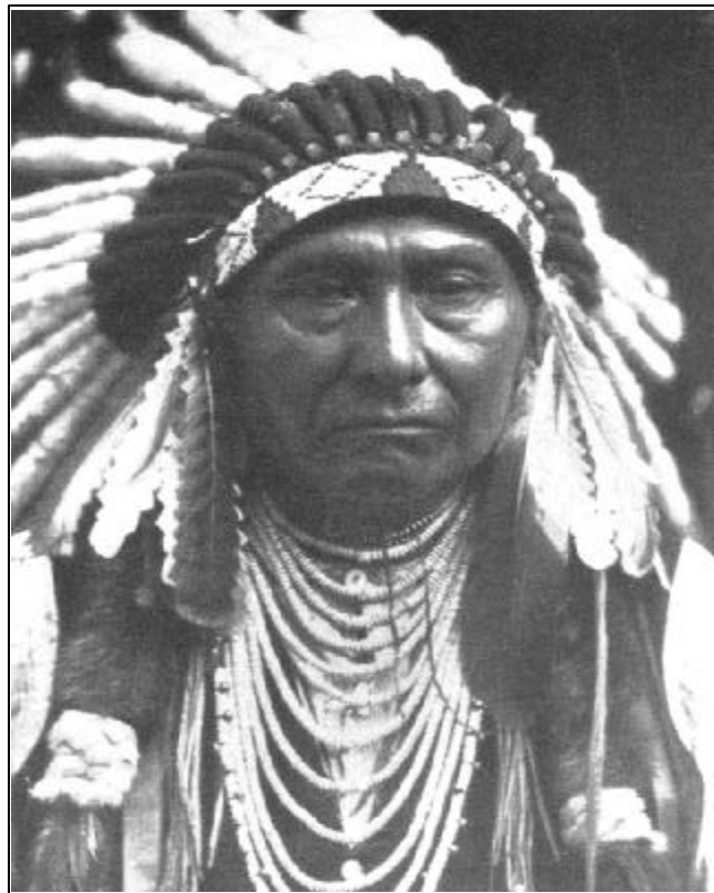
Chief Joseph [Hinmaton-Yalaktit]

Source: "An Indian's Views of Indian Affairs," North American Review , April 1879.