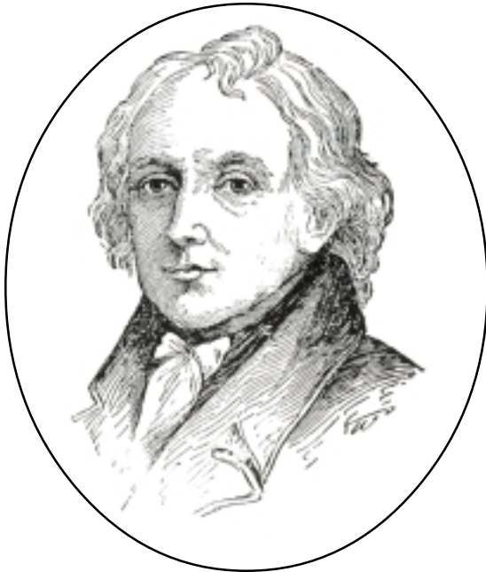
Mason Locke Weems

Parson Mason Locke Weems was an Anglican minister who left the ministry to become a book peddler and writer. His biography of Washington, The Life of George Washington: With Curious Anecdotes, Equally Honorable to Himself, and Exemplary to His Young Countrymen , published in 1799, was extremely popular. The myth of the cherry tree first appeared in the fifth edition, published in 1806.