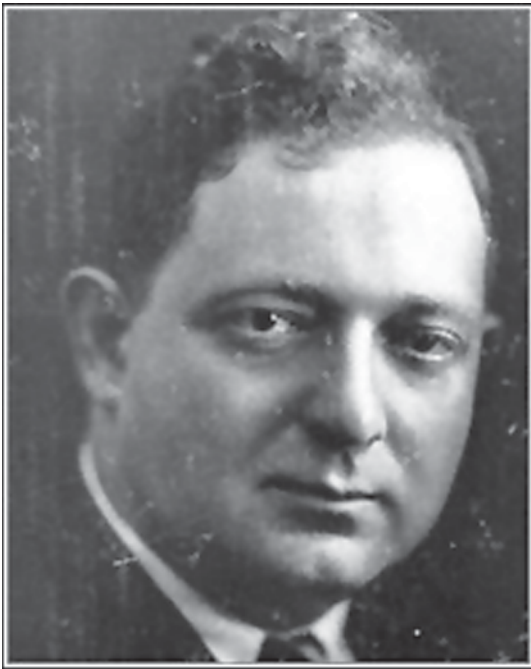
Benjamin Gitlow Library of Congress LC-USZ62-83357, n.d.

Justice Edward Terry Sanford wrote for the majority: