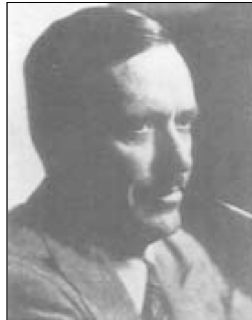
Earl Browder Leader of the American Communist Party (through 1945). Elizabeth Bentley claimed that her lover and fellow spy, Jacob Golos, received his contact from Browder