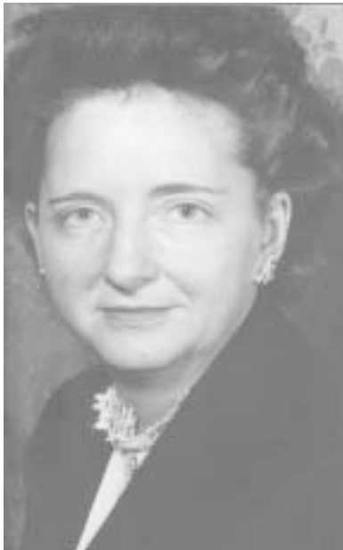
Elizabeth Bentley 1948

Source: U.S. Congress, House; House Committee on Un-American Activities, Hearings Regarding Communist Espionage in the United States Government (United States Government Printing Office: 80th Cong., 2nd sess., July 31, 1948).