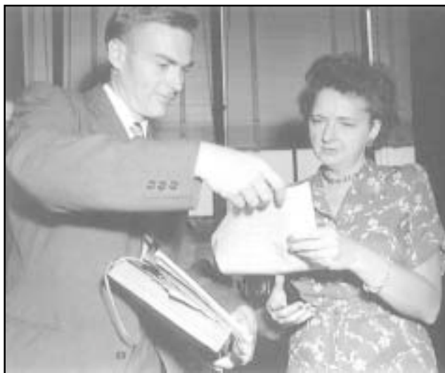
(Left) After defecting to Canada, former Soviet spy Igor Gouzenko would appear in public with a bag over his head to protect himself from communist vengeance. (Right) William Remington, one of those Elizabeth Bentley accused of communist espionage, shows her some documents.