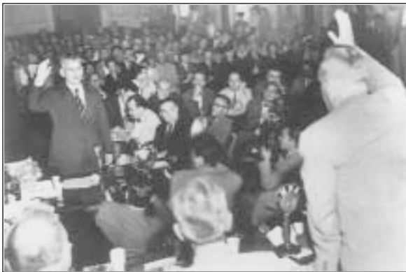
Rep. Karl Mundt (R.S.D.), chairman of House Unamerican Activities Subcommittee (right), swears in Nathan Gregory Silvermaster (1948).