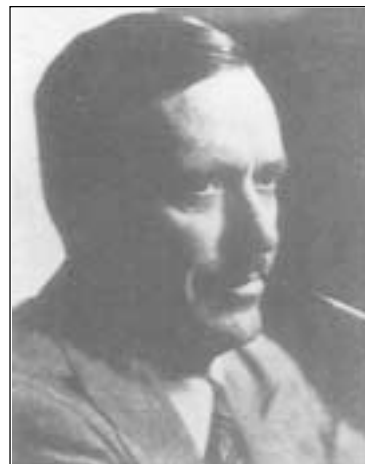
Earl Browder Leader of the American Communist Party (through 1945). Elizabeth Bentley claimed that her lover and fellow spy, Jacob Golos, received his contact from Browder