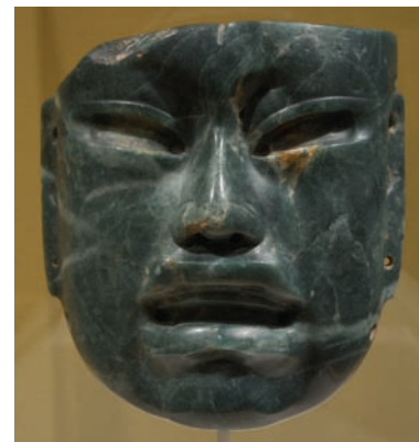
Mask, 10th–6th century b.c. Mexico; Olmec—Bequest of Alice K. Bache, 1977; Metropolitan Museum of Art

Take a trip across the world and back through the ages to experience the art of many cultures and historical periods. Thirteen themes encompass hundreds of paintings, drawings, sculptures, photos, and works in non-traditional media in this vibrant approach to the study and appreciation of art. International artists, scholars and curators from major museums and specialized collections guide the viewer through the millennia of human thought and expression while contemporary artists and their work bring the forms into the present day. An extensive Web site includes sortable images of more than 250 works, as well as an online text helping viewers to explore the works and topics in greater depth. The series, text, and Web resources can be used to supplement art history courses, or for individual learning and enrichment. Produced by THIRTEEN in association with WNET.ORG. 2009.